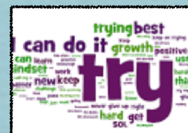
A Poem for Year 6

SATs week is fast approaching so we will be working hard. We will be revising and consolidating all we have learnt in preparation. Your support at home with home learning is much appreciated.